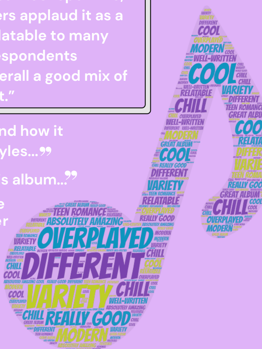
On a scale of 1-5, what would you rate the album?